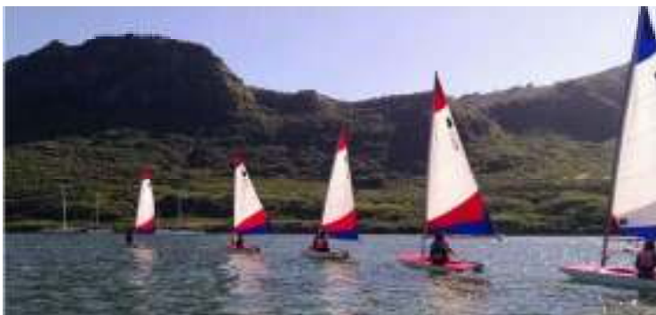
Sailing game - follow the leader!