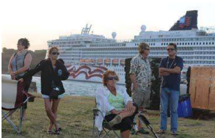
Mole People, visitors, and friends waiting for the boats to come back around the breakwater. Don't forget your comfy chairs!