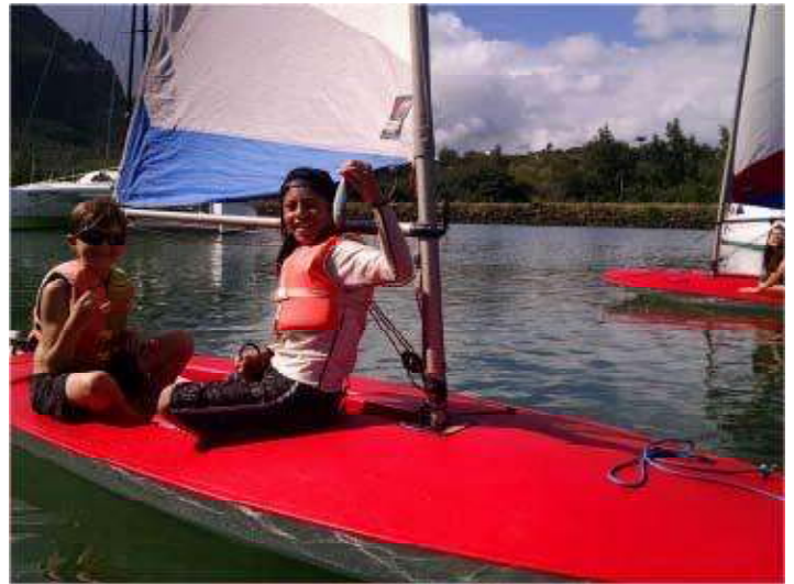
The boys are very proud of the dead fish they found while sailing in the harbour – boys, what can you do?

Winter Sailing Camp was simply excellent this year! It ran from December 28th through January 1st with 15 children in attendance. Highlights included, but were not limited to: An Italian New Year's celebration where pizza, ice cream, and sparkling apple juice were consumed; blindfolded rigging races; sailing relays; a guest sailing visit from JT Schoonover, and, of course, lots of boat capsizing!