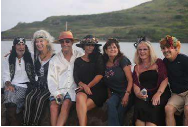
Mole People enjoying 2015's Halloween Race.

ambassador on the Mole as the spectating public may have lot of questions when they see a fleet of boats in Nawiliwili Harbor. If you have any interest in joining the exclusive “Mole People”, please contact me: ksarndt@live.com .