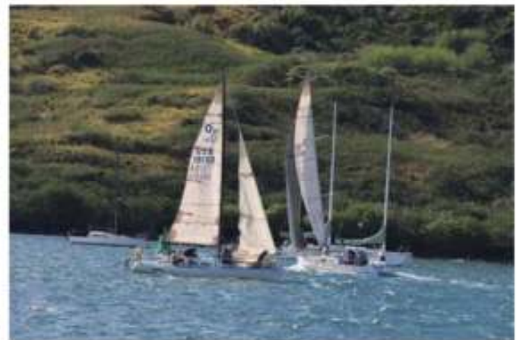
Opening Day 2015