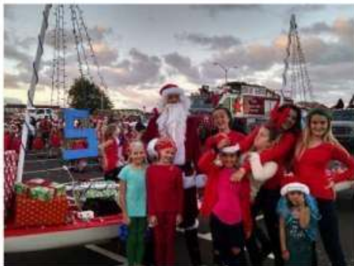
The crew at the staging area before the parade. (Red and Green Christmas or Port and Starboard?)