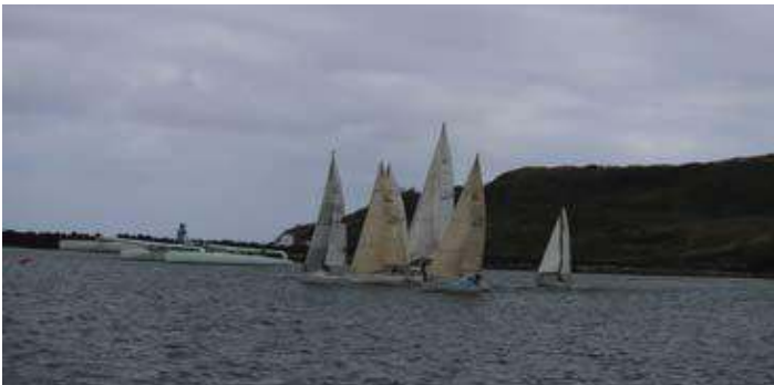
Bunching up just before the start of Race #6