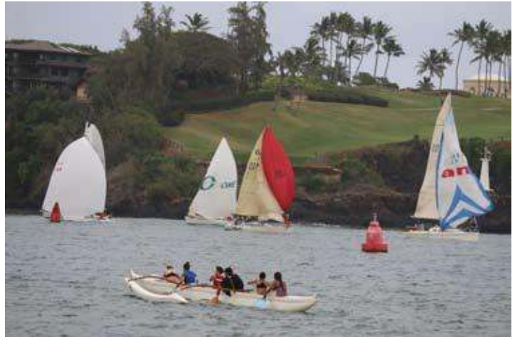
Sharing Kalapaki Bay .....