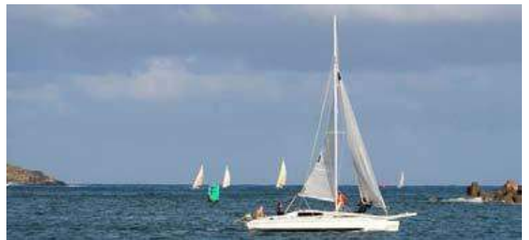
Trinity leaving the field in her wake during Race #3 .....

* KEN DORLAND MEMORIAL SERIES was in full swing during March! Strong north winds have dominated this series with eight boats battling 20 MPH gusty conditions. Our lone trimaran Trinity joined the series in the third race generating excitement from spectators on the Mole.