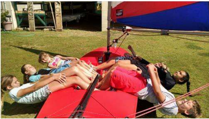
Hiking practice on land.