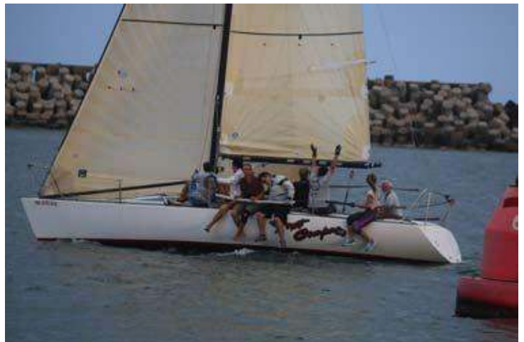
One second after crossing the finish line.