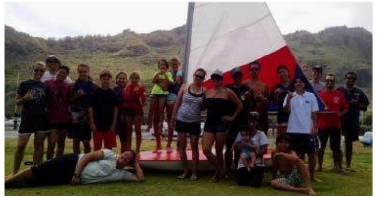
Watch: Holo Holo Keiki is all smiles after a morning of sailing.