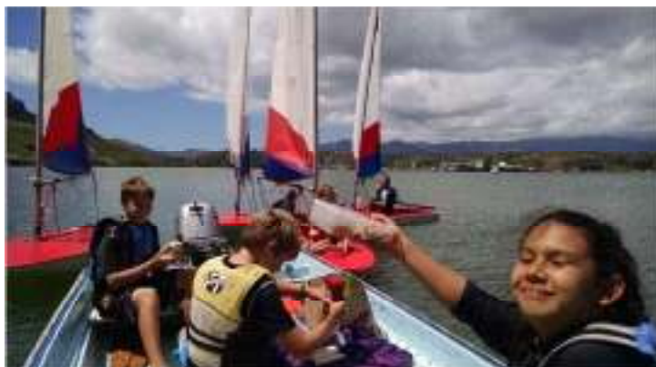
Enjoying Lunch on the water during an 'all day sail'

March 16th-20th: An Intermediate Sailing Camp was held with six students in attendance. The camp focused on upwind sailing and jibing. Each keiki started out the camp with a 'sunken ship'. It was their challenge to remove 'rocks' from their 'sunken ship' by mastering certain skills. I am pleased to announce that by the end of camp all ships were floating — some even flying.