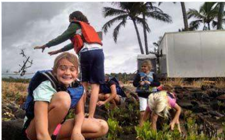
Mangrove eradication in action!